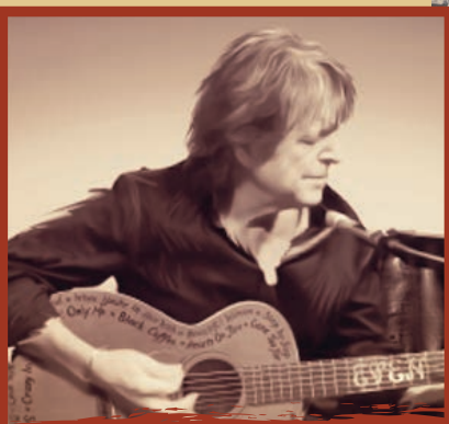
I LOVE A RAINY NIGHT EVEN STEVENS